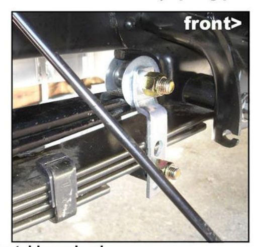
front & rear ~ adjustable preload

Refer to SuperSprings application guide for part selection www.supersprings.com [Tech line #866-898-0720] SuperSprings enhance load carrying capability, handling & towing. Never exceed vehicle manufacturer's GVWR rating.