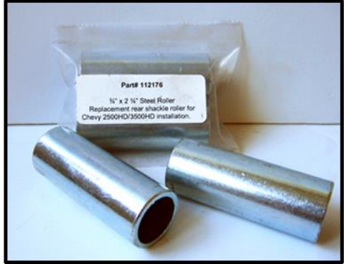
Replacement rear shackle roller for GM 2500/3500 HD installation (inside SSA15 box)