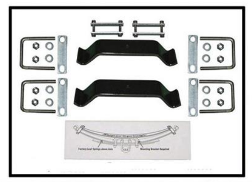
SuperSprings Mounting Kit # MTKT Installed ———