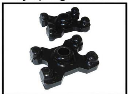
Polyurethane Mounting Base