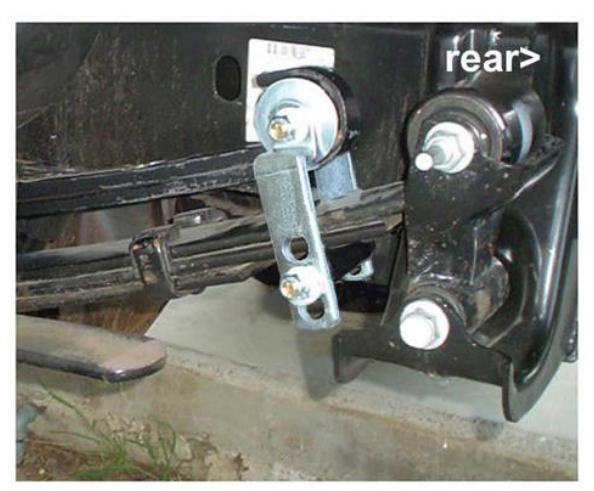
Adjustable pre-load and ride height [frnt/rear]

Refer to SuperSprings application guide for part selection www.supersprings.com [Tech line #866-898-0720] SuperSprings enhance load carrying capability, handling & towing. Never exceed vehicle manufacturer's GVWR rating.