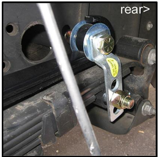
front & rear ~ adjustable preload

Refer to SuperSprings application guide for part selection www.supersprings.com [Tech line #866-898-0720] SuperSprings enhance load carrying capability, handling & towing. Never exceed vehicle manufacturer's GVWR rating.