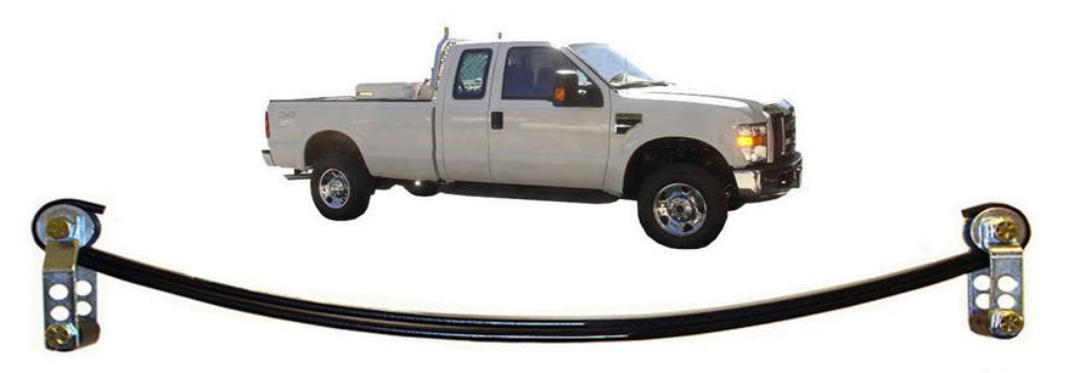
Poly Spring Pad PSP-7

Ford F-250 F-350 Super Duty [2008 ~ 2010] without factory top overload SuperSprings Part# SSA10 ~ SSA15 with PSP-7