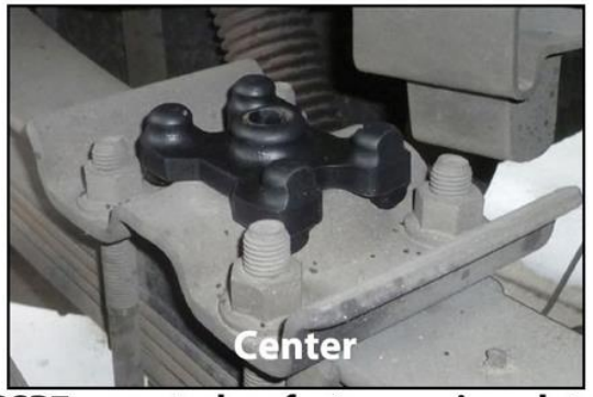
PSP7 mounted on factory spring plate