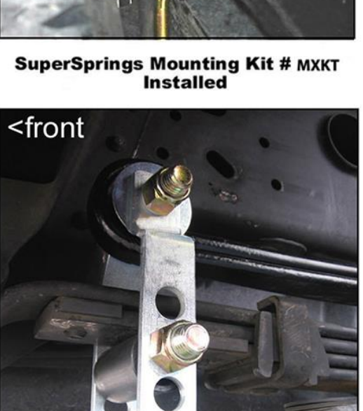
front ~ spring eye bolt threads out