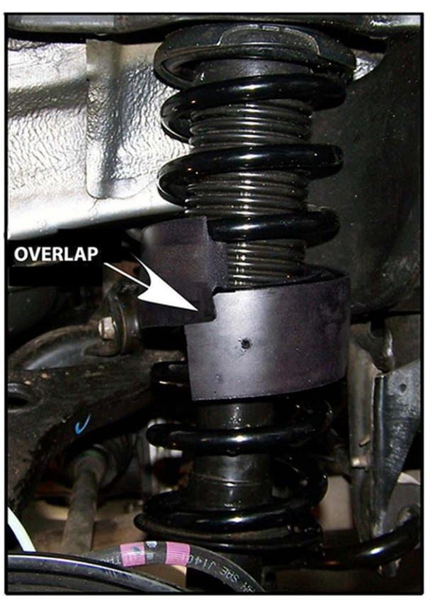
Installed on a 2011 Outback To complete installation install nylon wire ties

Refer to SumoSprings application guide for part selection www.supersprings.com [Tech line #866-898-0720] SumoSprings enhance load carrying capability, handling & towing. Never exceed vehicle manufacturer's GVWR rating.