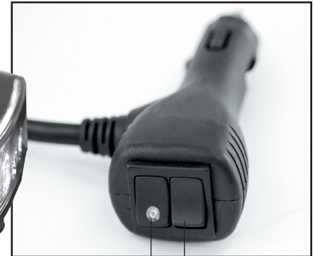
on/off ——— flash pattern selector